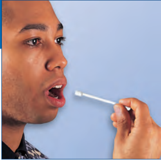
1. Swab mouth to collect saliva.