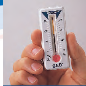
3. Read color bar.